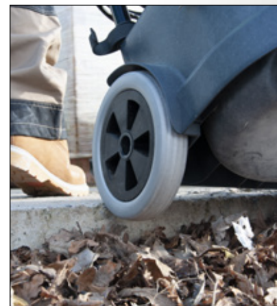
Large, "site-ready" wheels for stairs, kerbs and uneven surfaces