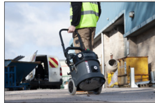
No lifting or carrying